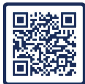
Public Safety Calendar