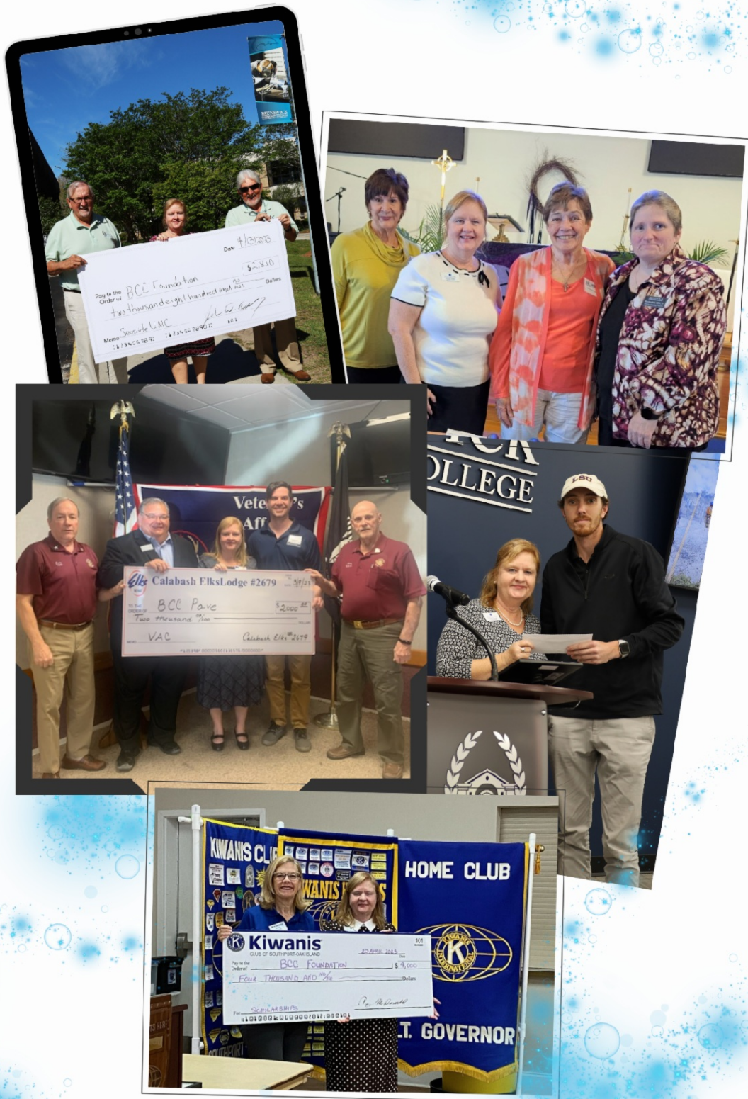
Photo Captions: Thanks to your generosity, April was a busy month at The Foundation of BCC!